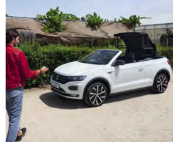
Model shown is T-Roc Cabriolet R-Line with optional 19" 'San Marino' alloy wheels and non-metallic paint.

The Administrator may, in your name, take over and deal with a claim to try to recover from others any money the Administrator has paid out under this policy. At all times you must give the Administrator whatever help it needs.