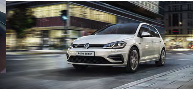
Model shown is Golf R-Line Edition with optional 18" 'Sebring' alloy wheels, panoramic sunroof and Oryx White premium signature paint.