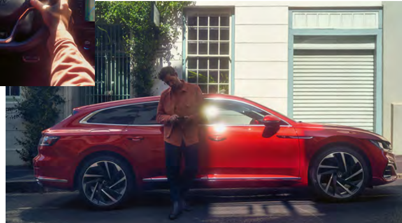
Front cover model shown is new Tiguan R-Line with optional 'IQ. Light' LED headlights and metallic paint. Model shown on this page is new Arteon Shooting Brake R-Line with optional 20" 'Nashville' alloy wheels, Dynamic Chassis Control (DCC), 'IQ. Light' LED headlights, Park Assist and metallic paint.