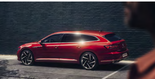
Model shown is new Arteon Shooting Brake R-Line with optional 20" 'Nashville' alloy wheels, Dynamic Chassis Control (DCC), 'IQ. Light' LED headlights, Park Assist and metallic paint.

You can also email us at complaints@insurance-volkswagen.co.uk