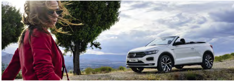
Model shown is T-Roc Cabriolet R-Line with optional 19" 'San Marino' alloy wheels and non-metallic paint.