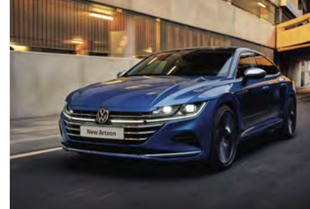
Model shown is new Arteon Elegance with optional 20" 'Rosario Dark Graphite' matt alloy wheels, Dynamic Chassis Control (DCC), 'IQ. Light' LED headlights, sunroof, Assistance Pack Plus, rear tinted glass and metallic paint.

An authorised United Kingdom finance company with whom you have a finance agreement in respect of your vehicle .