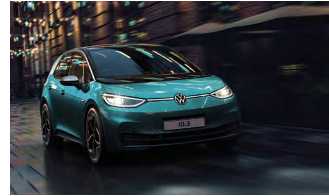
Model shown is ID.3 1 st Edition

This policy is designed to help you in the event that your vehicle is stolen or damaged beyond economical repair and deemed to be a total loss by your motor insurer .