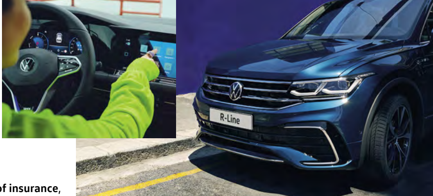
Model shown (above) is new Tiguan R-Line with optional 'IQ. Light' LED headlights and metallic paint.

Following the total loss of your vehicle during the period of insurance , we will pay the difference between the insured value and the purchase price of your vehicle if you have purchased your vehicle outright or with a finance agreement .