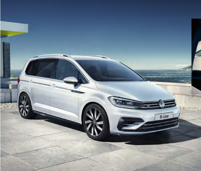
Model shown (left) is Touran R-Line with optional LED premium headlights.

Means a policy issued by a motor insurer in accordance with the Road Traffic Act 1988, which insures your vehicle on a comprehensive basis for the full market value of your vehicle throughout the period of insurance . Where your vehicle is being used by any permitted driver, a comprehensive motor insurance policy must be held by them in respect of your vehicle . Please note: Motor trade insurance policies of any type are excluded.