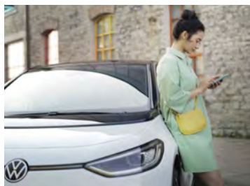
Models shown (above) are T-Roc SEL with optional two-tone black roof and metallic paint and T-Roc Design with optional 18" 'Arlo' Sterling Silver alloy wheels and metallic paint.