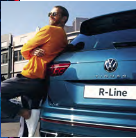
Model shown (far left) is new Golf GTI with optional 19" 'Adelaide' Black diamond-turned alloy wheels. 'Vienna' leather upholstery, panoramic sunroof and metallic paint. Model shown (left) is new Tiguan R-Line with optional 'IQ. Light' LED headlights and metallic paint.