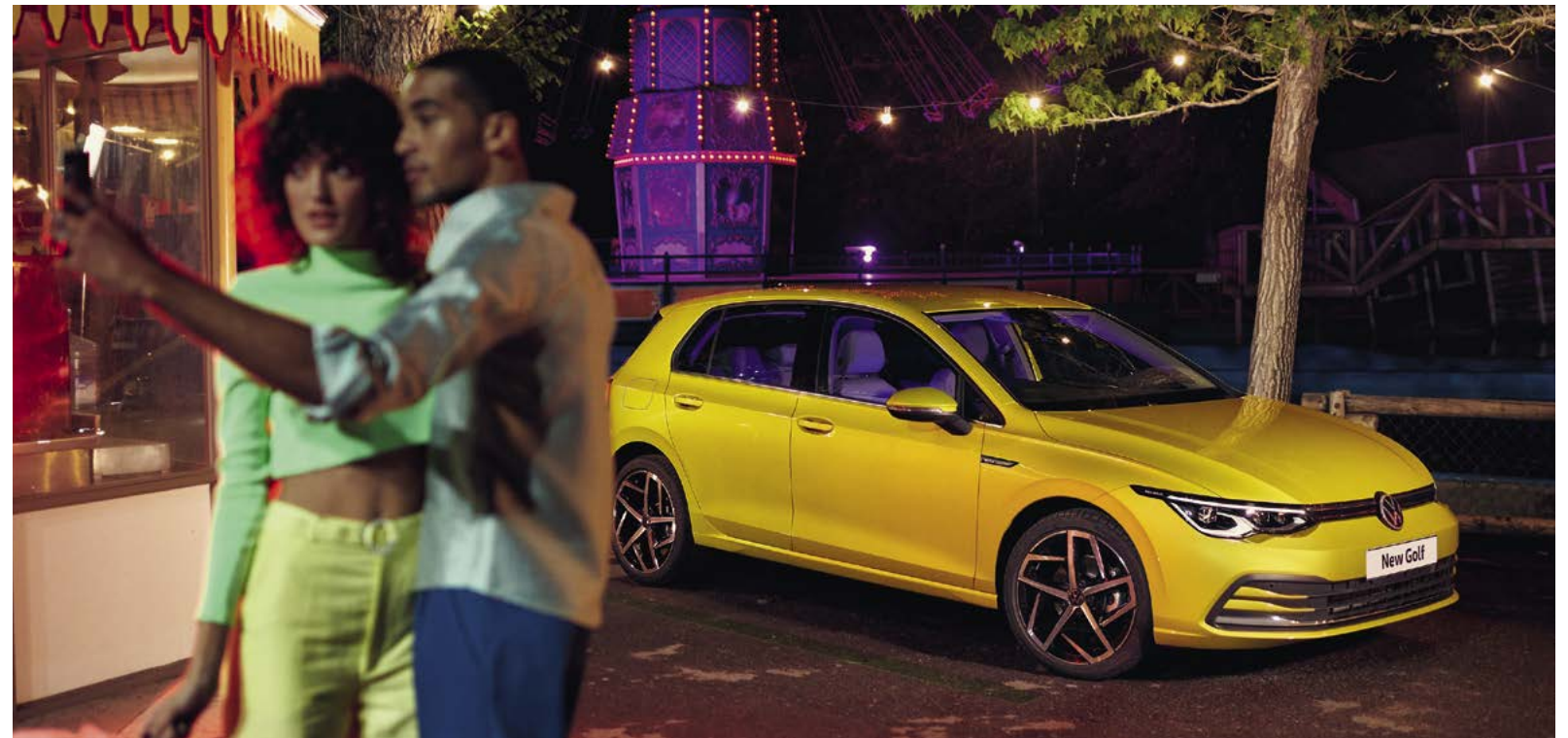
Model shown is new Golf Style with optional 18" 'Dallas' alloy wheels and 'IQ. Light' LED matrix headlights.

The maximum claim limit is based on your vehicle purchase price and is shown in your schedule .