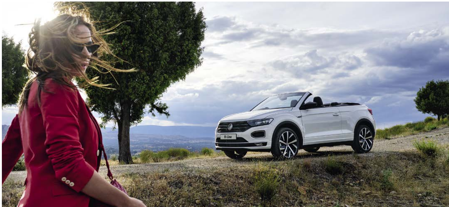
Model shown (above) is T-Roc Cabriolet R-Line with optional 19" 'San Marino' alloy wheels and non-metallic paint. Model shown (right) is new Arteon Shooting Brake R-Line with optional 20" 'Nashville' alloy wheels, Dynamic Chassis Control (DCC), 'IQ. Light' LED headlights, Park Assist and metallic paint.