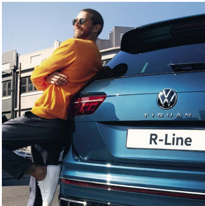
Model shown is new Tiguan R-Line with optional 'IQ. Light' LED headlights and metallic paint.

Whenever the following words or expressions appear in your policy, they have the meaning given below. For ease of reference, defined words or expressions in your policy are shown in bold type.