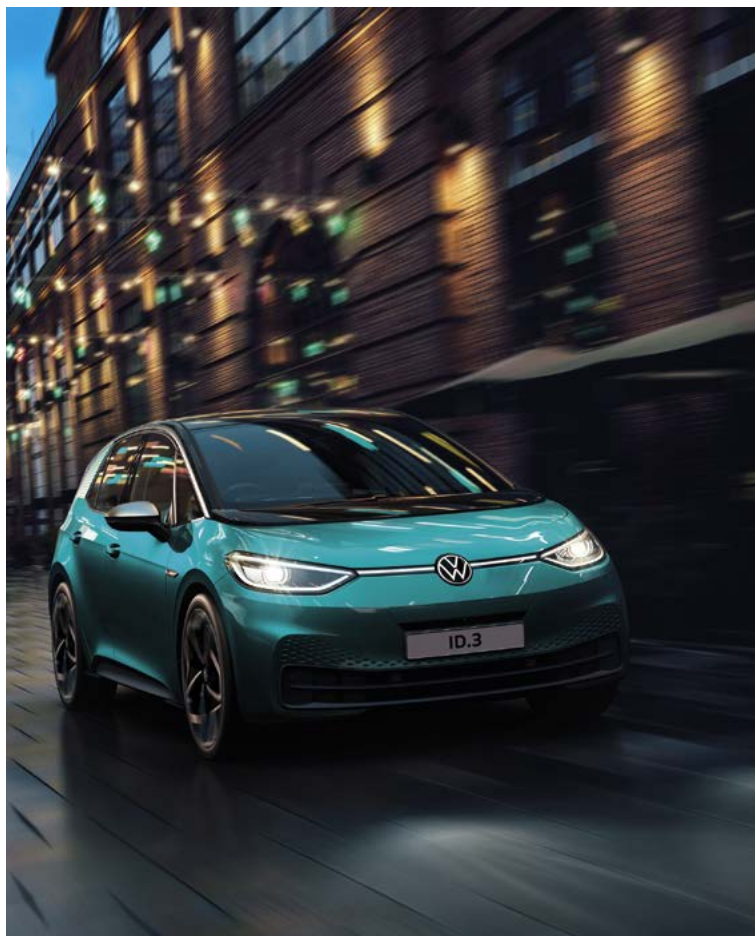
Model shown is ID.3 1 st Edition

Please also take a couple of minutes to check the details we hold for you on your schedule and tell us immediately if there are any mistakes.