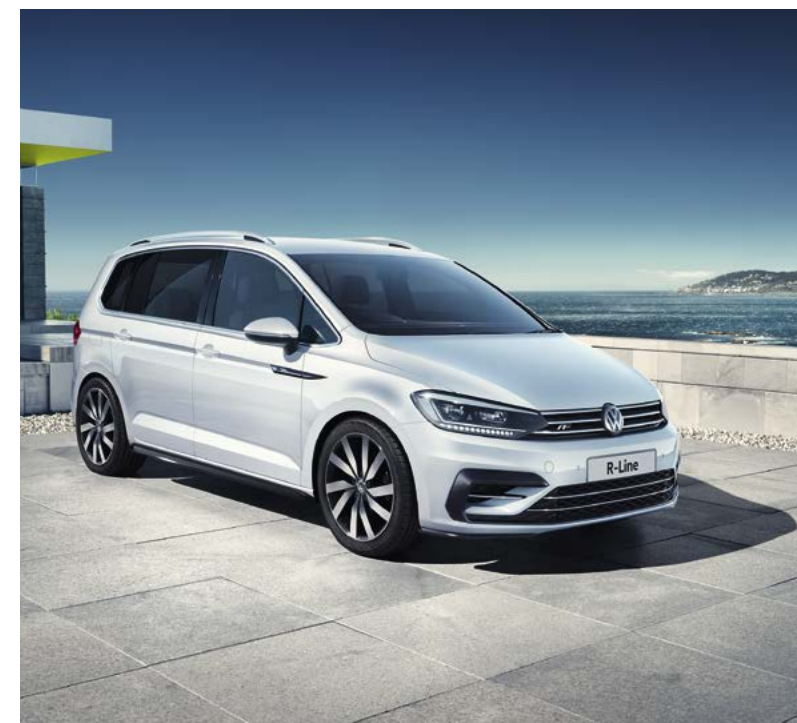
Model shown is Touran R-Line with optional LED premium headlights.