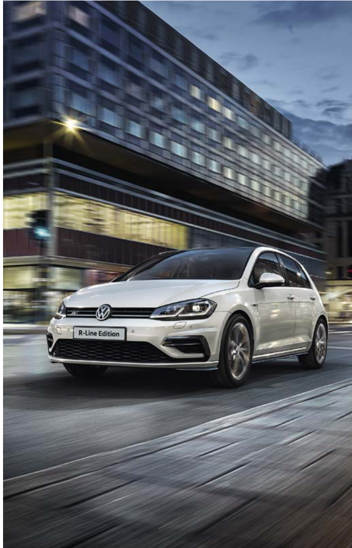
Model shown is Golf R-Line Edition with optional 18" 'Sebring' alloy wheels, panoramic sunroof and Oryx White premium signature paint.