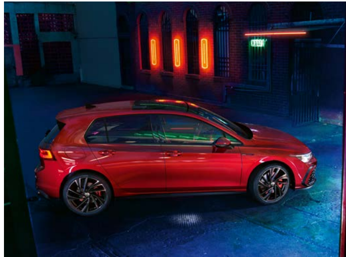
Model shown is new Golf GTI with optional 19" 'Adelaide' Black diamond-turned alloy wheels. 'Vienna' leather upholstery, panoramic sunroof and metallic paint.

The total amount you have agreed to pay us for this insurance policy. If you have not paid your premium , we will not provide cover from the date the premium was due. If the monthly payment option has been chosen and any instalment is not paid, your policy will end 30 days after the date the missed instalment was due.