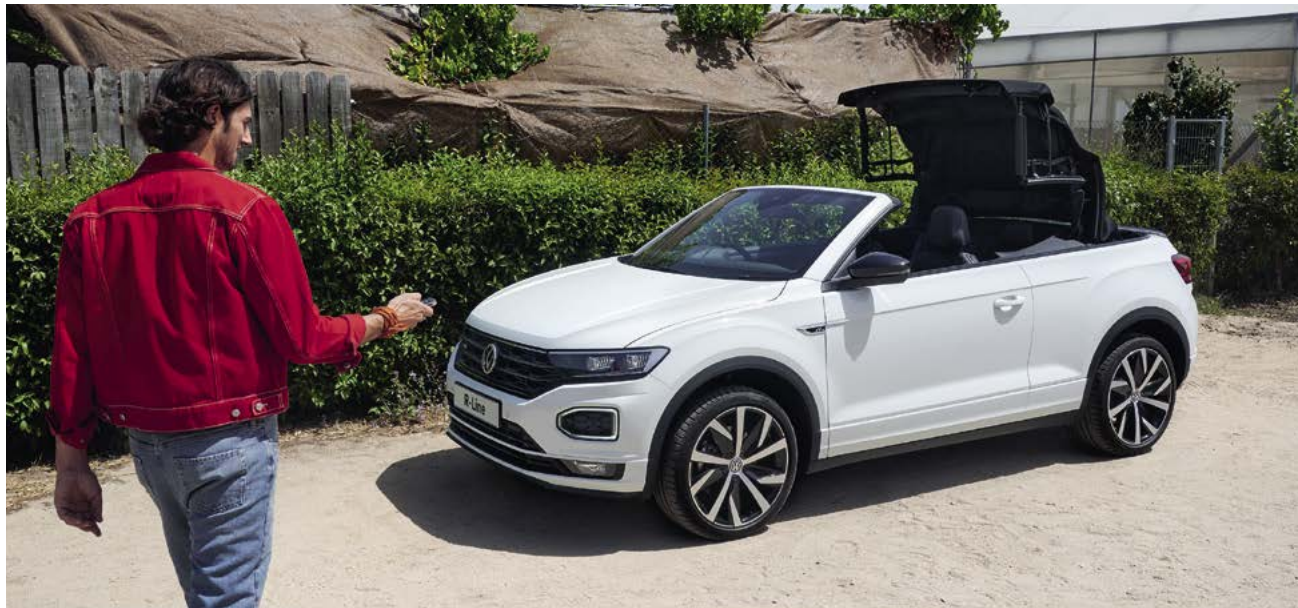
Model shown is T-Roc Cabriolet R-Line with optional 19" 'San Marino' alloy wheels and non-metallic paint.

For further information, you can visit The Motor Ombudsman website at www.TheMotorOmbudsman.org or call their Information Line on 0345 241 3008.