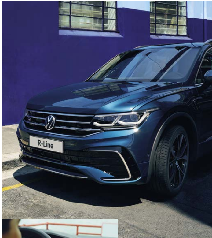
Model shown is new Tiguan R-Line with optional 'IQ. Light' LED headlights and metallic paint.