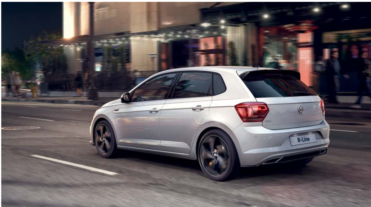
Model shown is new Polo R-Line with optional 17" 'Bonneville' Black diamond-turned alloy wheels and metallic paint.