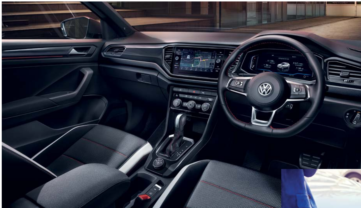
Interior shown is T-Roc SEL DSG 4MOTION with optional Sport pack, beats soundpack, carpet mats and metallic paint.