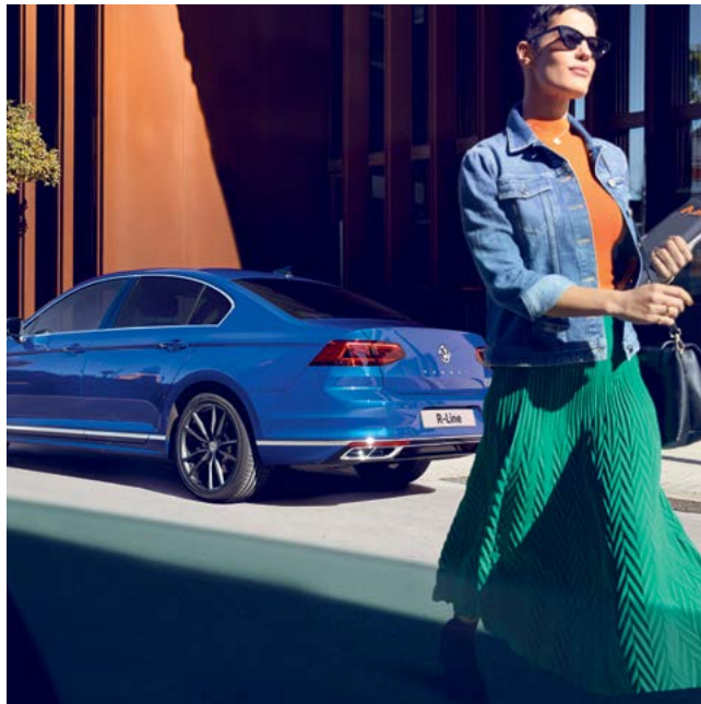
Model shown is new Passat R-Line with optional 'IQ. Light' LED matrix headlights, 19" 'Pretoria' Dark Graphite Matt alloy wheels and metallic signature paint.

When your vehicle is declared a total loss , please contact us . You will need your certificate of insurance and vehicle registration to hand. You can contact us :