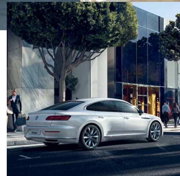
Model shown is Arteon Elegance 2.0 Itr BiTDI SCR 4MOTION with optional 19" 'Chennai' alloy wheels and Oryx White premium signature paint.