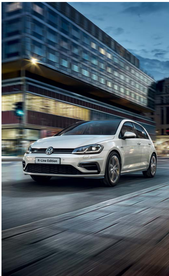
Model shown is Golf R-Line Edition with optional 18" 'Sebring' alloy wheels, panoramic sunroof and Oryx White premium signature paint.