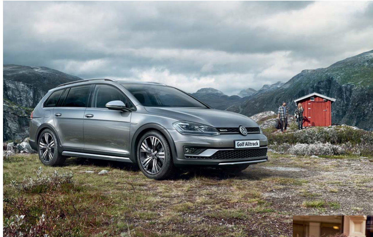
Model shown is Golf Alltrack with optional 18" 'Kalamata' alloy wheels, Winter pack and metallic paint.

If you have any difficulties reading this document, please contact the Customer Services Team.