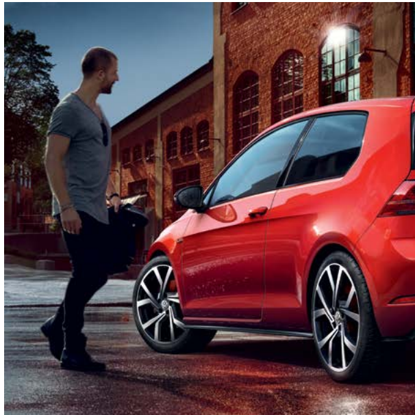
Model shown is Golf GTI Performance with optional 19" 'Brescia' alloy wheels and Tornado Red non-metallic paint.

These words have the following meaning throughout this policy, where highlighted bold: