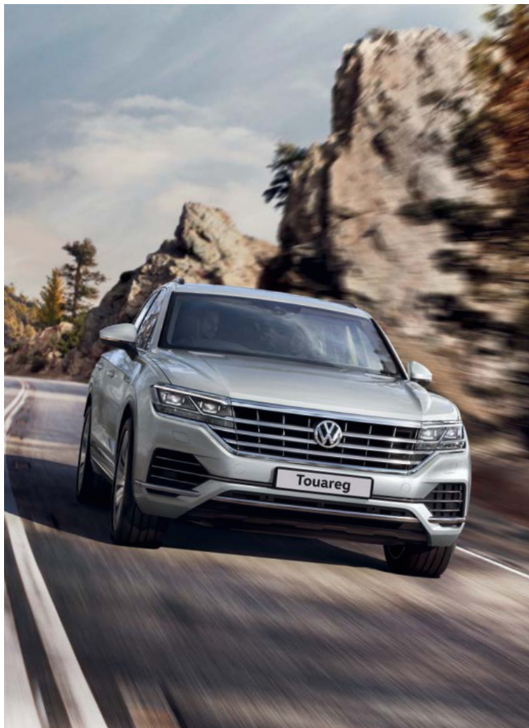
Model shown is Touareg SEL with optional 21" 'Suzuka' Dark Graphite diamond-turned alloy wheels, air suspension, 'IQ. Light' LED matrix headlights, headlight washers and metallic paint.